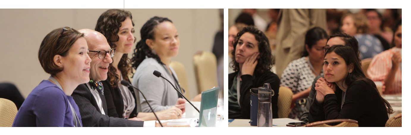
More than 1,250 people attended the 2017 Forum , which featured three days of sessions, panels, a debate, award presentations, networking lunches, abstract and poster presentations, and two days of pre-conference sessions.