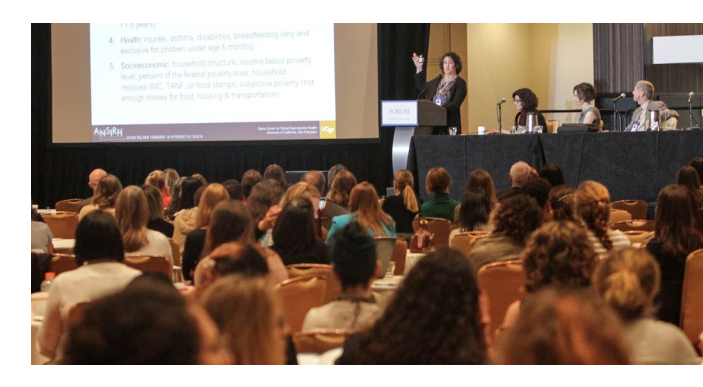
With a shared focus on advancing the science of abortion and contraception, SFP members provide each other with a valuable sense of community.

Many SFP members, grantees, and board members were key authors of publications that received the most attention in 2017 from academics, traditional and social media, and other sources. Please see "<u>Most talked-about</u> <u>family planning publications of 2017</u>" for more on this important work.